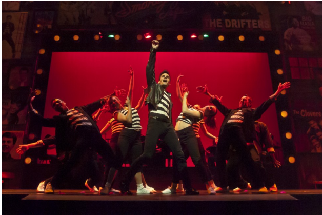
NJYT's production of Smokey Joe's Cafe