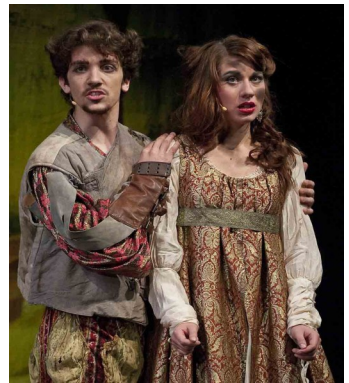
NJYT’s Production of Kiss Me, Kate