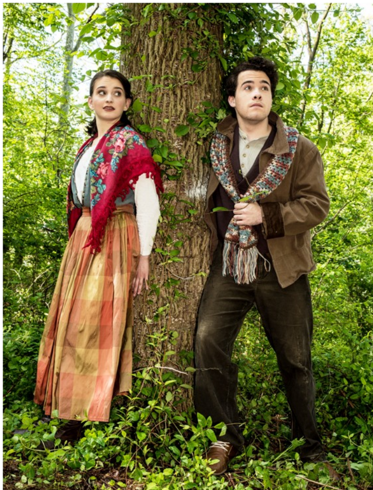
NJYT 2016 Production of Into the Woods

State Recognized for Excellence in Theatre Arts Training