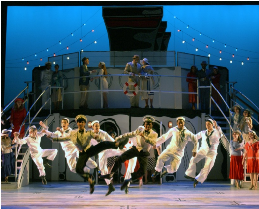
NJYT’s production of Anything Goes