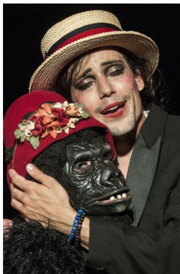
NJYT's productions of KISS ME, KATE (Left) and CABARET (Right)