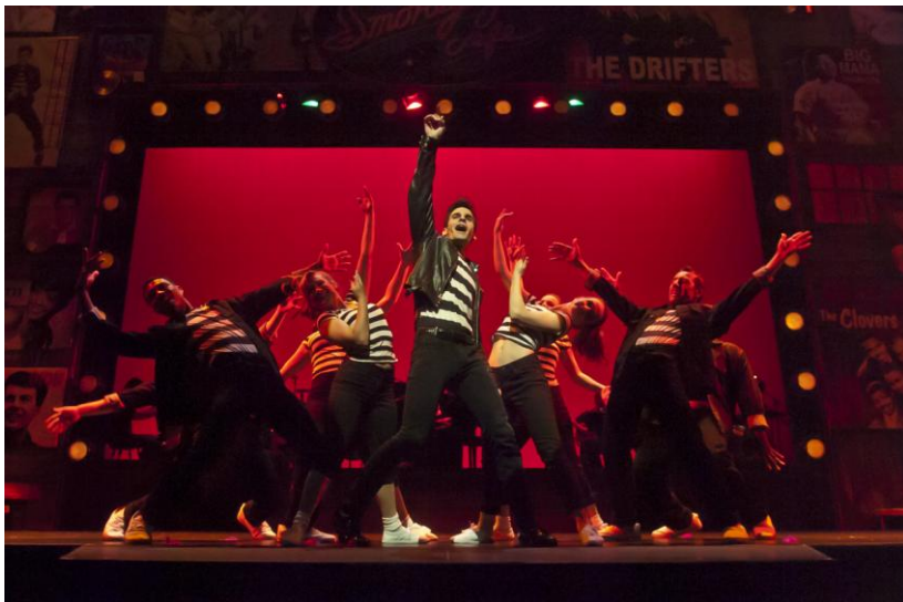
From NJYT's production of Smokey Joe's Cafe