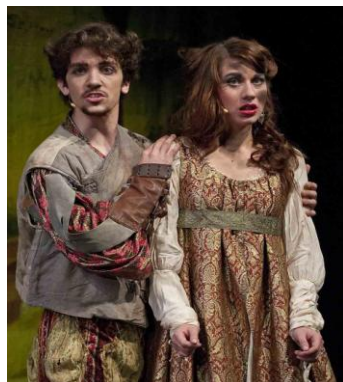
NJYT's Production of Kiss Me, Kate