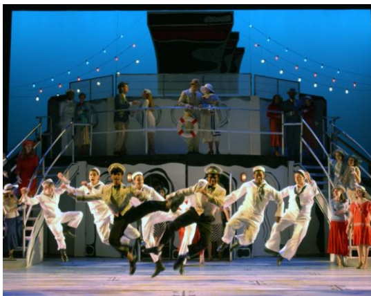
NJYT's production of Anything Goes